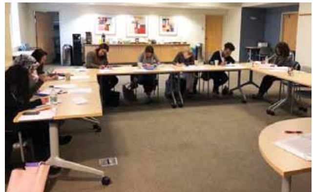
Volunteers and Research Interns participate in orientation to learn more about PPSNE.