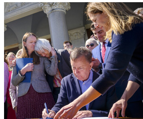
CT's Gov. Ned Lamont signs the Reproductive Freedom Defense Act into law in May 2022

In Connecticut, the Reproductive Freedom Defense Act was passed and signed into law in 2022, expanding access to abortion by removing medically unnecessary barriers in state regulations that prevented qualified, trained advanced practice clinicians (APCs) from providing aspiration abortion for their patients. The law also helps protect abortion providers and patients receiving abortion care in Connecticut from the "bounty hunter" provisions included in copy cat Texas abortion bans across the country.