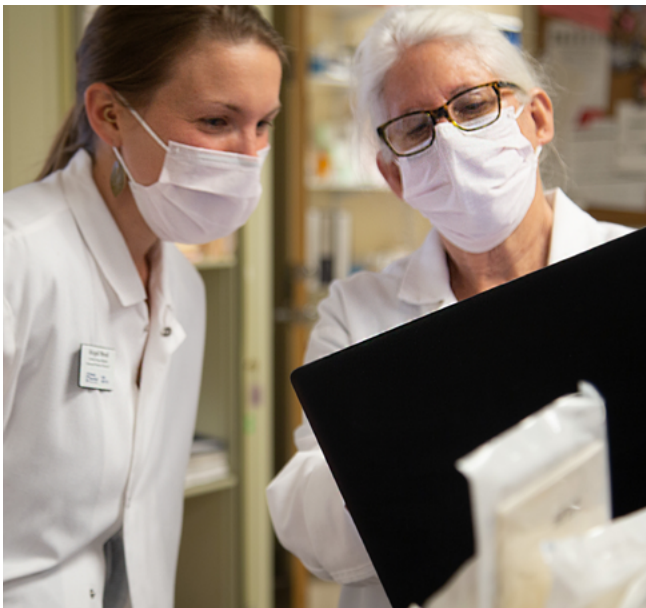
Pictured Above: Two health care providers review PPRM's Medical Standards & Guidelines at our Santa Fe Health Center.

Today and every day, Planned Parenthood of the Rocky Mountains will do everything we can to provide care to every patient who seeks it. We're committed to ensuring patients have access to abortion care – regardless of where they live.