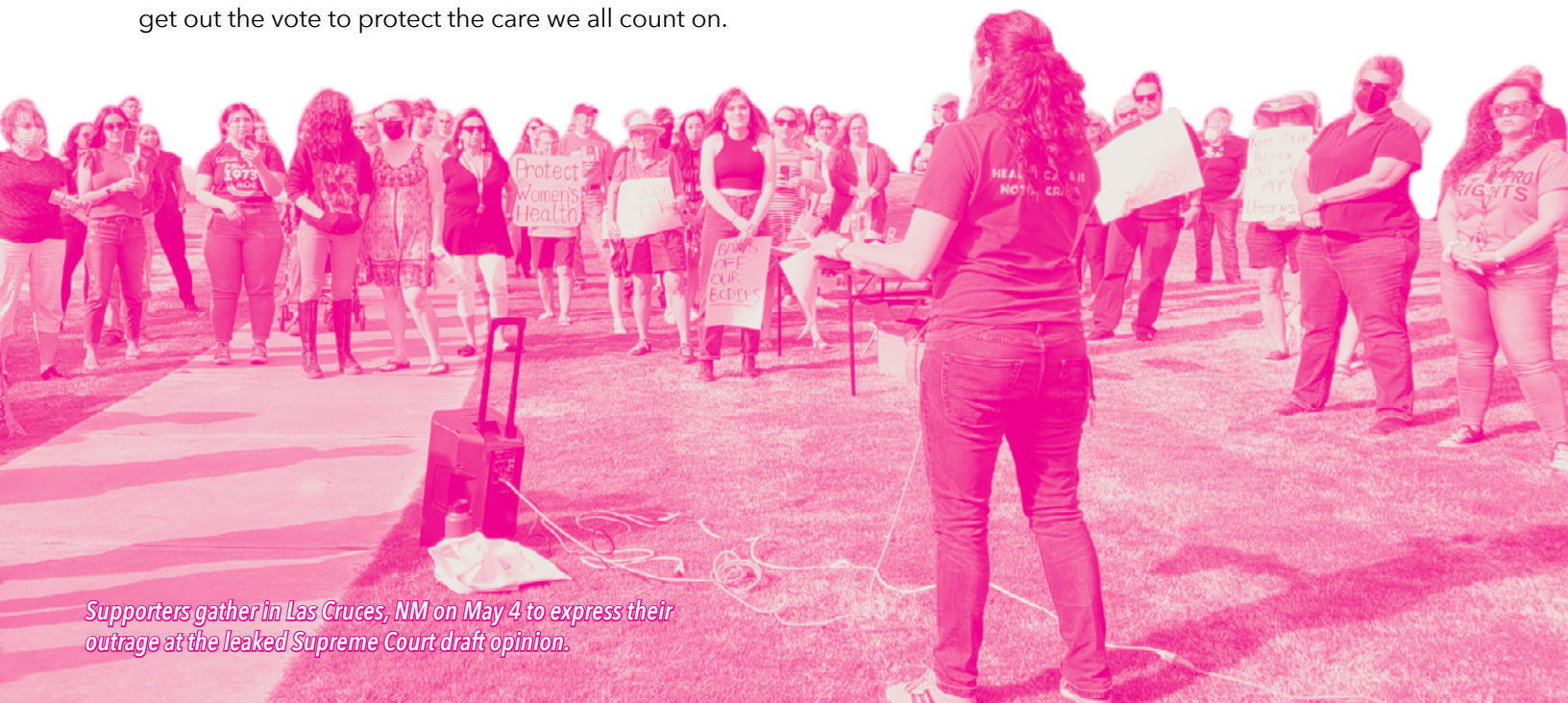
Supporters gather in Las Cruces, NM on May 4 to express their outrage at the leaked Supreme Court draft opinion.