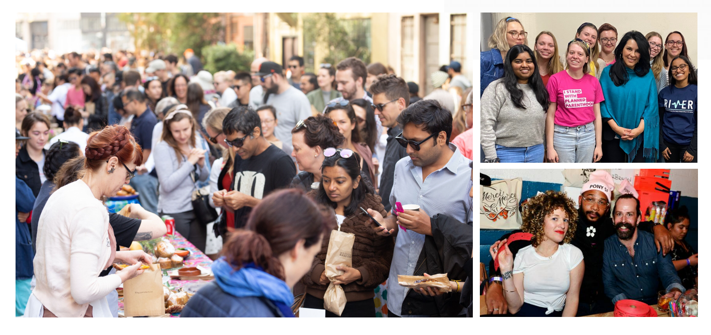
Pictured above: Various Pop Up fundraisers and speaking engagements.