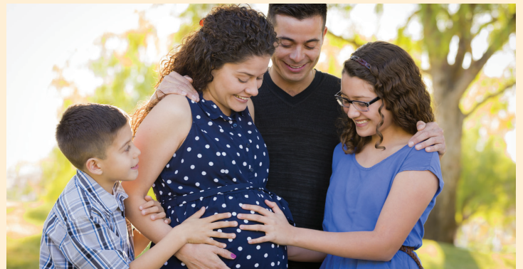
PPSNE has partnered with the Connecticut Campaign for Paid Family Leave to push for new legislation in Connecticut.

Dozens of advocates who support Paid Family Leave, including U.S. Representative Rosa DeLauro, packed the State Capitol in Hartford earlier this spring to testify in support of the legislation.