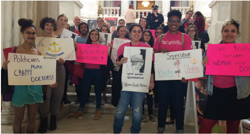
Fearless millennials and long-time supporters of women’s rights rallied together at Lobby Day earlier this spring at the RI State House.