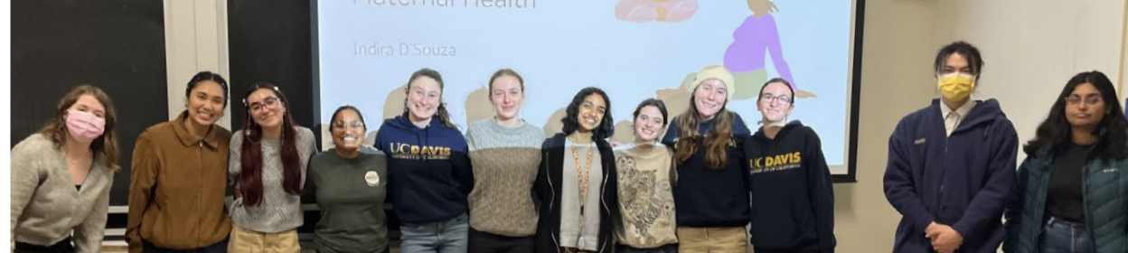
PPMM's Gen Action Club, Students for Reproductive Freedom, at UC-Davis

Students for Reproductive Freedom, PPMM's Gen Action Club at UC-Davis, just got the exciting news that they have been selected to make a short presentation at the national conference of the Association of Maternal & Child Health Programs (AMCHP), being held this April in Oakland.