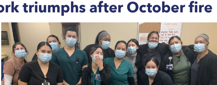
Staff at North Stockton health center

The fire on the night of October 26 that destroyed part of the Eastland Plaza health center in Stockton posed a difficult challenge to staff who were determined to continue patient care in the community.