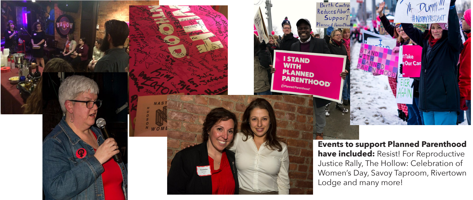
Events to support Planned Parenthood have included: Resist! For Reproductive Justice Rally, The Hollow: Celebration of Women's Day, Savoy Taproom, Rivertown Lodge and many more!