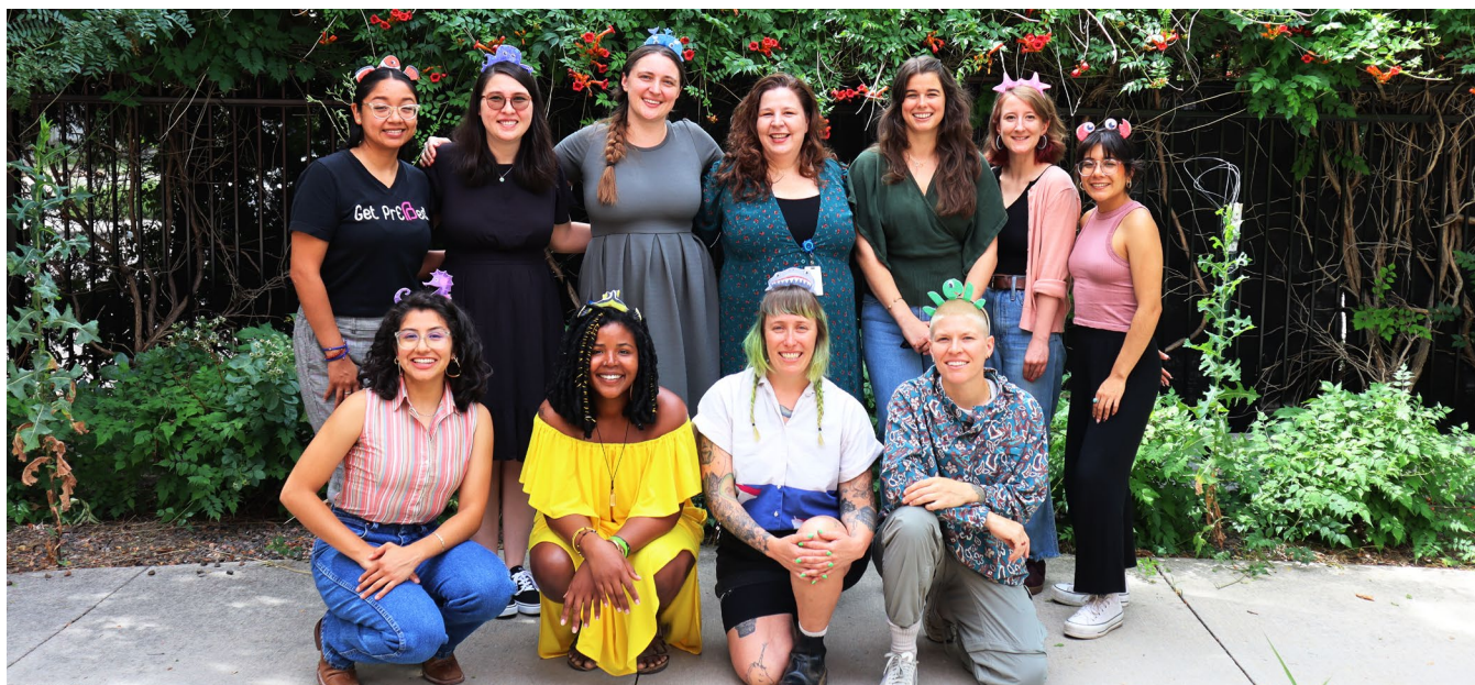
Responsible Sex Education (RSEI) team photo