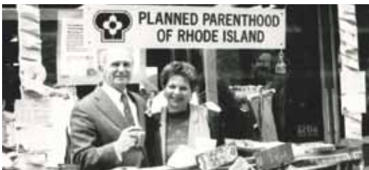
The Rhode Island Maternal Health Association took on a more familiar name in 1964: Planned Parenthood of Rhode Island.

Now named the Rhode Island Maternal Health Association (RIMHA), basic GYN care provided included Pap tests and breast exams. Although more patients were coming for help, and services were expanded to include pre-marital counseling and fertility advice, the work was still controversial and the social agencies were forced to remove the RIMHA from their listings.