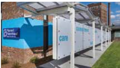
Providence, RI health center located at 175 Broad Street.

In January 2011, PPSNE launched its most ambitious and comprehensive campaign in its history. The $22 million Building Futures Campaign was developed around three key priority areas: transforming health centers, growing education programs to better engage youth and expanding health care delivery and access. When the campaign concluded, six health centers were renovated and/or relocated across CT and RI.