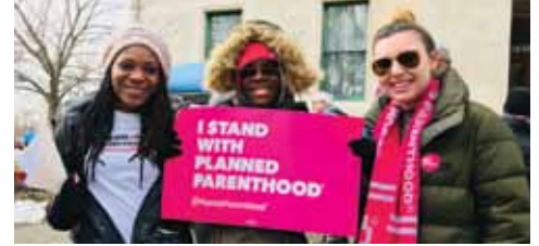
People of all ages and backgrounds stand together in the fight against threats to their communities.