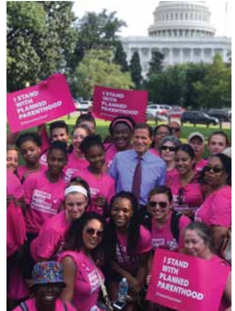
Activists have called, marched, rallied and even traveled to Washington, D.C. to demand Congress protect health care and access to Planned Parenthood. Sen. Richard Blumenthal stands with our supporters and PPSNE in D.C.

With you by our side we will continue to fight back against threats to our bodies, our lives, and our communities! You keep proving that whatever the opposition throws at us, we have the power to win. Thank you for all you do to advocate for reproductive health and rights and protect access to Planned Parenthood for our patients.