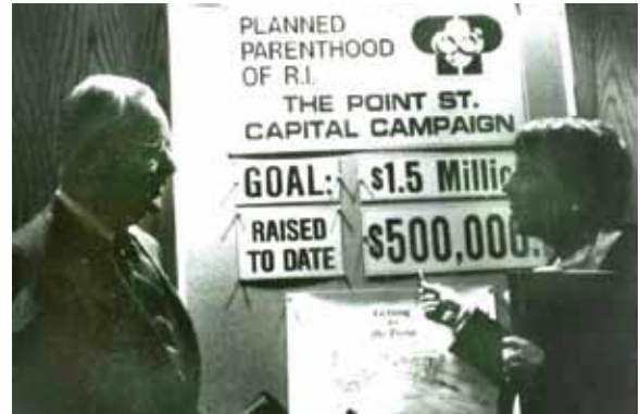
The Campaign was in full swing as PPRI aimed to move its health center.

Planned Parenthood of Rhode Island completed the Point Street Campaign and moved its health center and administrative offices to a new location in Providence, RI, where it remained for three decades.