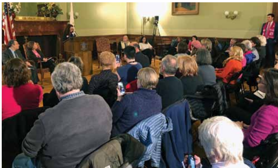
Faith leaders, health care providers, and social justice advocates packed into the RI State House for a press conference in support of the Reproductive Health Care Act last month.

In 2017 and 2018, thousands of people gathered at the RI Women's March – standing up for the rights of all people as the movement for reproductive freedom continues to grow. People across Rhode Island are demanding action to protect reproductive freedom and affirm the autonomy