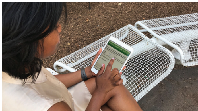
Patients can access the Press Ganey Patient Satisfaction Survey from anywhere - on any device - to offer feedback on their visit to PPSNE.

Health center teams review the data, look for gaps in patient experience, identify patterns in the response and develop a plan of action to address concerns. Patients also comment