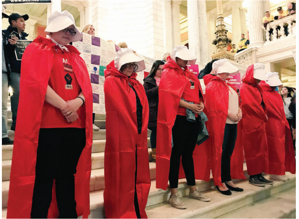
Activists dressed as characters from "The Handmaid's Tale" – a dystopian novel by Margaret Atwood and a popular TV show based on her book where women are viewed as nothing more than reproductive vessels who cannot control their own reproductive freedom – lineup in the Rhode Island State House before a hearing on the Reproductive Health Care Act in April.

Lead by PPSNE, the Coalition has held a series of retreats and conversations with community partners to plan a collective strategy for moving the state forward. The Coalition has over 20-member organizations and a dedicated Executive Committee that steers the day-to-day work of fighting for reproductive freedom. To date, we have worked with our legislative allies to reintroduce the Reproductive Health Care Act (RHCA) and an expanded bill to protect access to contraception.