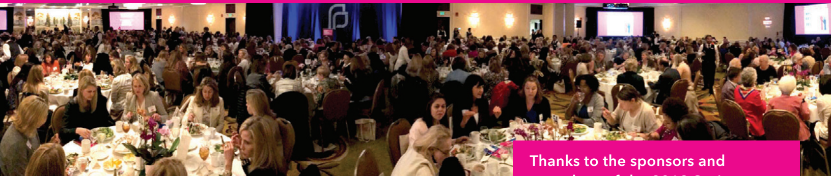
A crowd of nearly 600 Planned Parenthood of Southern New England supporters filled the Stamford, CT Marriott on April 4, 2018 for the annual PPSNE Spring Luncheon.

Volunteers are the backbone of our organization and we could not do our work without them. To learn more about our volunteer opportunities, and to get involved, email volunteers@ppsne.org or visit ppsne.org/volunteers today!