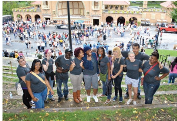
At AIDS Walk 2011 UHPP staff, volunteers and peer educators raised awareness AND over $400 to support HIV/AIDS resources in Columbia County.

Whatever methods are used, the focus is on going where teens congregate and using popular teen media to reach area youth with information about their opportunities and rights to confidential information and services. Using this model, we work first to educate about the risks and impact of unintended pregnancy and sexually transmitted infections, as well as the importance of self-respect, self-esteem and respectful relationships. These education messages are then coupled with