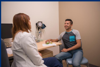
Planned Parenthood clinician discussing men's healthcare services with patient.

Planned Parenthood of Greater Texas is a trusted resource for men's healthcare! We're here for any questions or concerns men might have - men can ask us anything. Men rely on us for health services, including STI testing and treatment, HIV testing, medication to help prevent HIV transmission, gender affirming hormone therapy, condoms, and the human papillomavirus (HPV) vaccine.