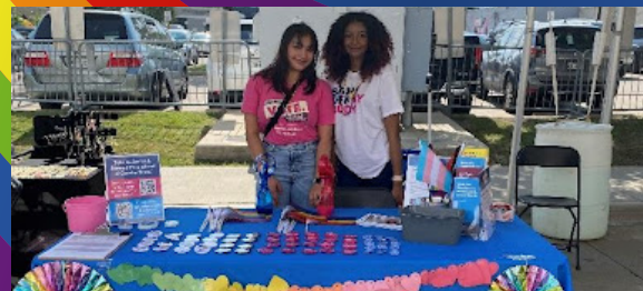
Planned Parenthood of Greater Texas' new summer leaders at the Arlington Pride festival.

For city-specific applications and information about TAB, scan here.