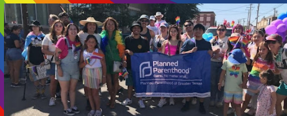
Sun City Pride Parade in El Paso, with Congresswoman Veronica Escobar in attendance.

Thank you to all who joined our Pride festivals and parades in June. It is inspiring when we all stand in support and solidarity with the LGBTQ+ community.