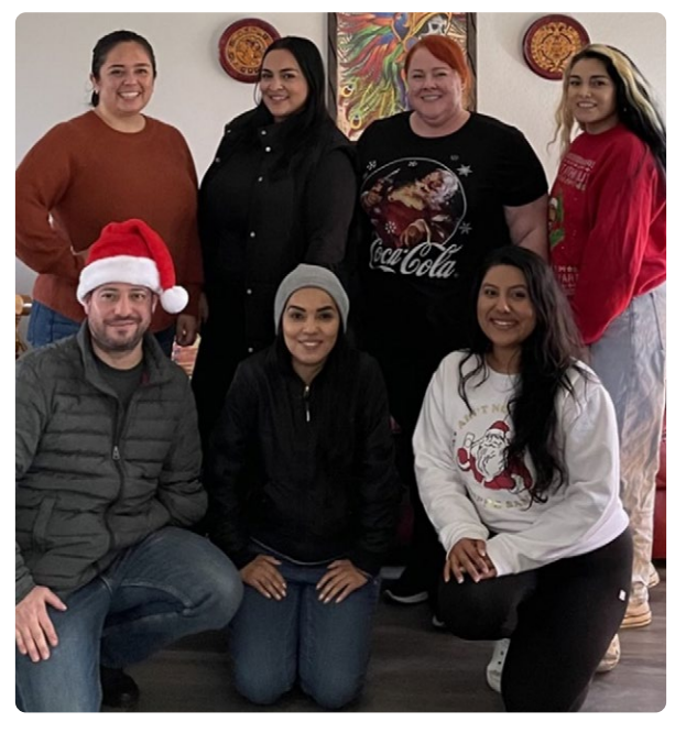
TPSP case management team

** CalWORKs (California Work Opportunity and Responsibility to Kids) is a social services program that gives cash aid and services to eligible California families in need. The program serves all 58 counties in the state and is operated locally by county welfare departments.