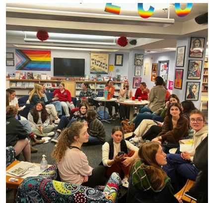
Colgate hosts Hamilton for a joint PPGen chapter meeting