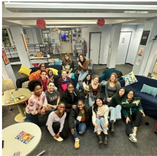
PPGen at Colgate meets for a chapter meeting

Planned Parenthood Generation Action (PPGen) is a network of student activists across our affiliate who organize on their campuses and in their local communities to mobilize advocates for reproductive freedom, raise public awareness about reproductive justice, educate peers about sexual health, and promote change on campus and beyond. From educational panels to fundraising to campaigns for on-campus medication abortion and contraceptive vending machines, our twelve chapters have been busy over the '22-'23 academic year. And as of last month, we have added a thirteenth chapter at Marist College in Poughkeepsie! Read on to hear more about what some of our chapters have been up to.