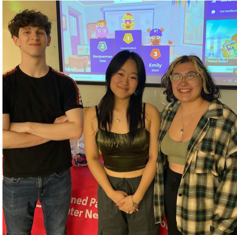
Members of PPGen at Binghamton host Cocktails and Consent with DOVE

Binghamton University made incredible strides in coalition building this year. PPGen at Bing hosted intersectional events with other campus groups, including a panel on Mass Incarceration in Broome County and sexual assault awareness events with Binghamton's DOVE (Domestic and Oppressive Violence Education) organization. Binghamton also raised money for the Brigid alliance throughout the year with a series of interactive fundraising activities.