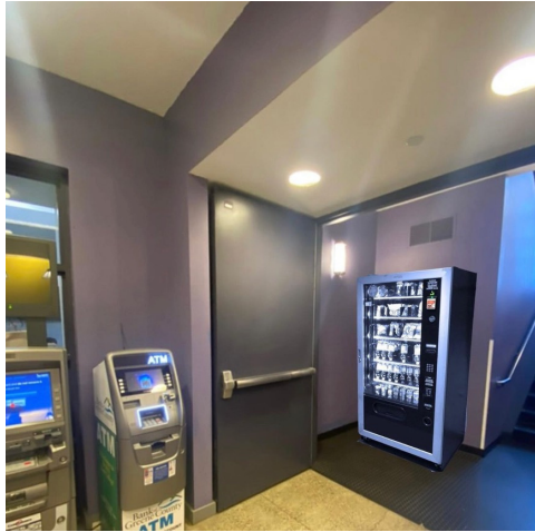
New wellness vending machines will begin operating this Fall at Bard

Bard College led a successful campaign to implement wellness vending machines on campus. These vending machines, which will include condoms, pregnancy tests, lubricant, Plan B, and harm reduction supplies are set to begin operation this fall. PPGen leader Ellen Herlihy was featured in an interview with Glamour Magazine in May 2023, discussing the importance of accessible contraception on campus.