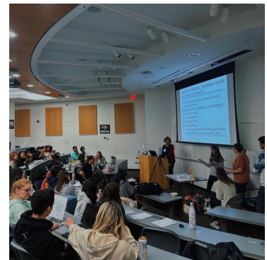
Members of PPGen at Touro (the OBGYN Interest Club) host a workshop on IUD insertion

In their inaugural year, the Fashion Institute of Technology participated in campus campaigns for abortion education and survivor support. • Led by the Reproductive Justice Collective of Barnard College, PPGen at Columbia University successfully petitioned their campus health center to provide medication abortion. This coalition also led a successful campaign for legislation that will provide Medication Abortion on SUNY and CUNY campuses (A1395C/S1213B). This bill was signed into Law on May 2. • PPGen at Ithaca College raised funds for RAINN through a campus-wide expired condom art contest. • Students at Union College held campus events to raise awareness around topics including safe sex and sexual assault. • PPGen at Cornell University ran a campaign to provide Plan B vending machines on campus. The Student Association passed a resolution in February approving the plan. • NYU built community with a visit to the Elizabeth A. Sackler Center for Feminist Art at the Brooklyn Museum. • Touro College of Osteopathic Medicine (OBGYN Interest Club) hosted a series of educational panels on topics ranging from Family Planning in Medical School to How to Insert an IUD.