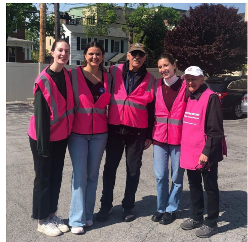
Members of Vassar Voices for Planned Parenthood and Poughkeepsie community members volunteer as health center escorts

Vassar College (Vassar Voices for Planned Parenthood) hosted events throughout the year, including "Cold Brew and Condoms" which featured free coffee, condoms and conversation, and a Thanksgiving 5k that raised over $500 for Sistersong Reproductive Justice Collective. Vassar Voices for Planned Parenthood also joined our health center escort team at the Poughkeepsie Health Center to help ensure our patients arrive at their appointments safe and supported.