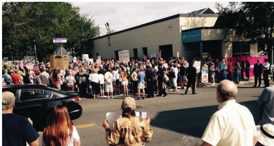
The street around the health center was closed down during a day of protest. PPSNE escorts played a vital role in ensuring patients were able to access the health center safely.

"We provide a buffer and offer patients support as we escort them to the building," said Clayt W., who has been volunteering for more than seven months. "We don't want anyone feeling alone or overwhelmed. The patients deserve to be supported. We have formed a special bond with the patients, and I look forward to continuing this work."