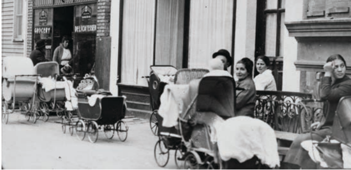
OUR PAST: Women and men sitting with baby carriages in front of the Sanger Clinic in New York City on October 27, 1916.

>>> Birth control, once out of reach, is widely available. Abortion, once a crime, is safe and legal. Planned Parenthood, once a single brownstone in Brooklyn, has nearly 650 health centers across the country – including 18 in Connecticut and Rhode Island. Planned Parenthood is honored to carry on a legacy of helping to ensure that all people have access to sexual and reproductive health and information.