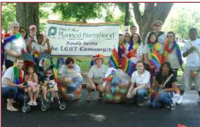
More than 30 UHPP staff members, volunteers and S.T.A.R.S. peer educators turned out to march in the annual Capital Region LGBT Pride Parade and Festival in Albany on June 13.