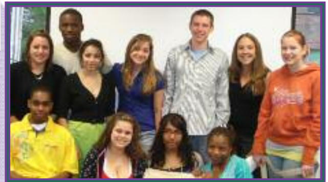
Columbia County S.T.A.R.S. end-of-year celebration.

The end of the school year is always a time of mixed feelings for the peer educators and for all who work with the UHPP S.T.A.R.S. (Seriously Talking About Responsible Sex) Peer Education program, as the old team phases out and the new team is recruited and hired. Nonetheless, the S.T.A.R.S. peer educators still managed to end the year with a flurry of activity!