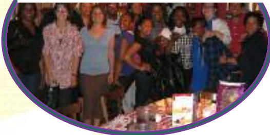
Albany County S.T.A.R.S. and their parents end-of-year celebration.